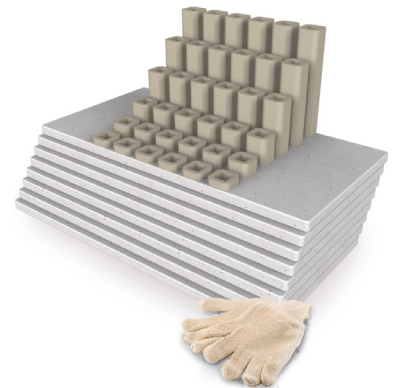
FURNITURE KIT FOR eFL2635

Other voltages for any country in the world are available. Examples are 200V/3 Phase Delta, 220V/3 Phase Delta, 415V/3 Phase Wye and 400V/3 Phase Wye. CE Listing available in some countries. See 380 Volt diagrams for electrical specifications for 400V/3 Phase Wye and 415V/3 Phase Wye.