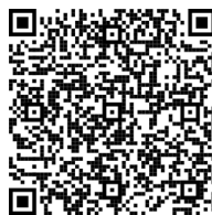
EFL INSTALL VIDEO

Scan OR Visit: hotkilns.com/eFL-install-video