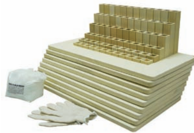
Furniture kit for an T3427-D

Shelves are high alumina cone 11 shelves. Shelves are 14" x 28" x 3/4". See below for quantity. One post kit includes six each 1/2", 1", 2" 4", 6" and 8" high 1-1/2" square cordierite posts. Furniture kit includes heat-resistant gloves and 1 lb of cone 10 kiln wash.