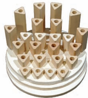
Furniture kit for a Fuego kiln.

Furniture / Accessory Kit: Furniture Kit: Includes three 12" diameter full shelves and four each of 1", 2", 4" and 6" triangular posts plus 1 lb of Cone 10 kiln wash.