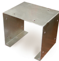
The Multi-Mounting Bracket

An adapter to mount the vent motor on the floor or point the outlet vertically for ceiling installations.